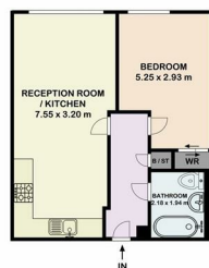
Top-Floor Flat (Second Floor)