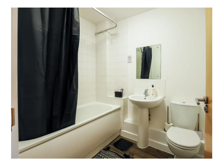
Council Tax Band – C Energy Efficiency – 82 (B)

NOTE - For clarification we wish to inform prospective purchasers that we have prepared these sales particulars as a general guide. We have not carried out a detailed survey nor tested the services, appliances and specific fittings. Room sizes should not be relied upon for carpets and furnishings.