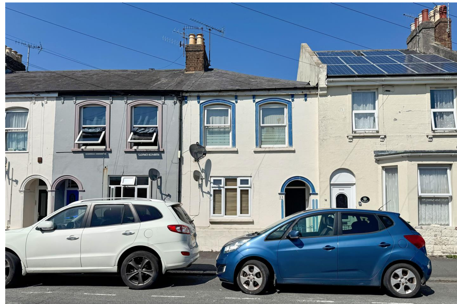
Glyn-Jones & Company are delighted to offer for sale this well presented ground floor apartment, available with no onward chain.