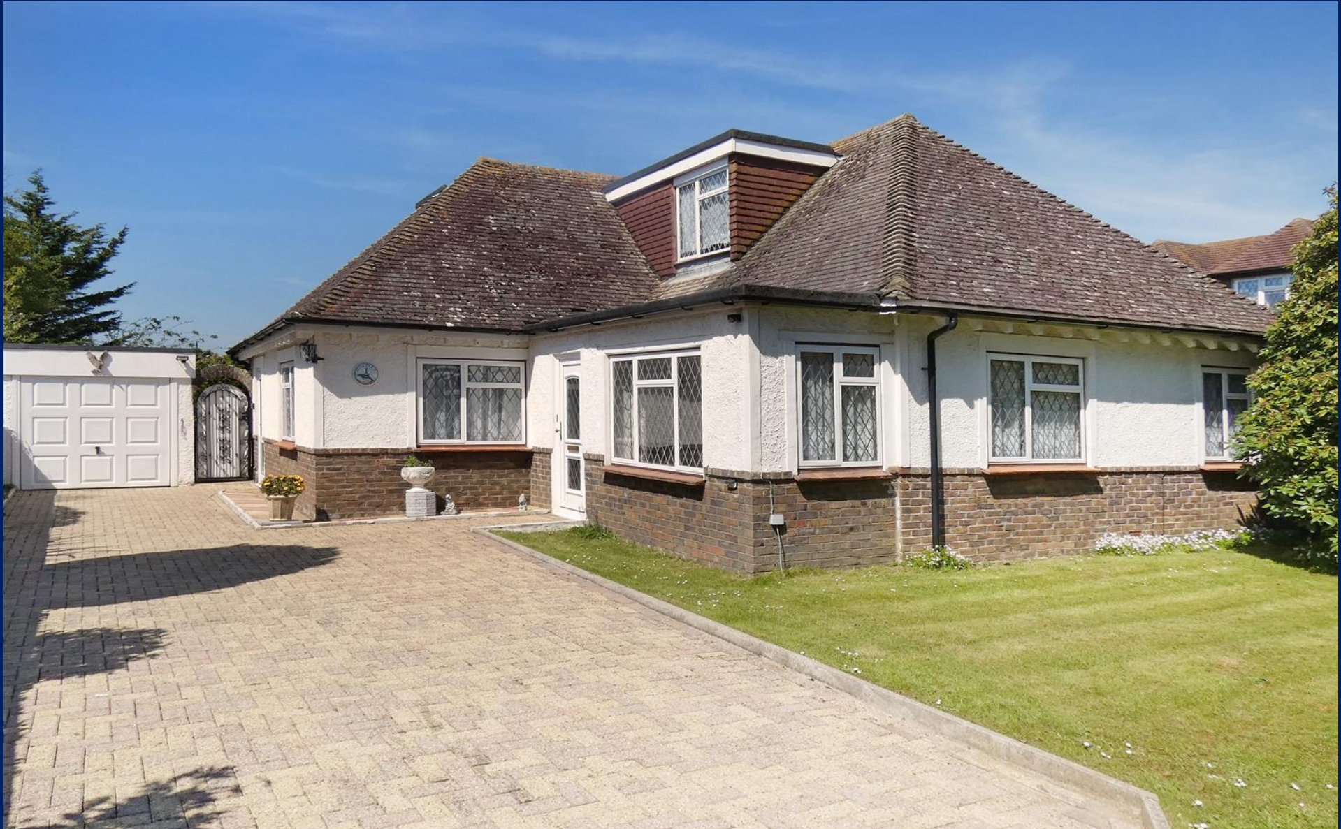
1 The Bramblings, Rustington West Sussex BN16 2BT

94 The Street, Rustington, West Sussex, BN16 3NJ Tel: 01903 770095 Email: rustington@glyn-jones.com www.glyn-jones.com