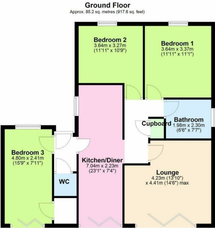
Total area: approx. 85.2 sq. metres (917.6 sq. feet)