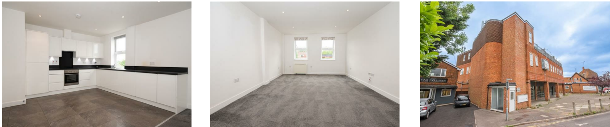
WEST HOUSE, PLOUGH ROAD, YATELEY GU46 £160,000

Camberley 01276 539111 Email: enquiries@knightspropertyservices.com 54 Obelisk Way, Camberley, Surrey GU15 3SG www.knightspropertyservices.com