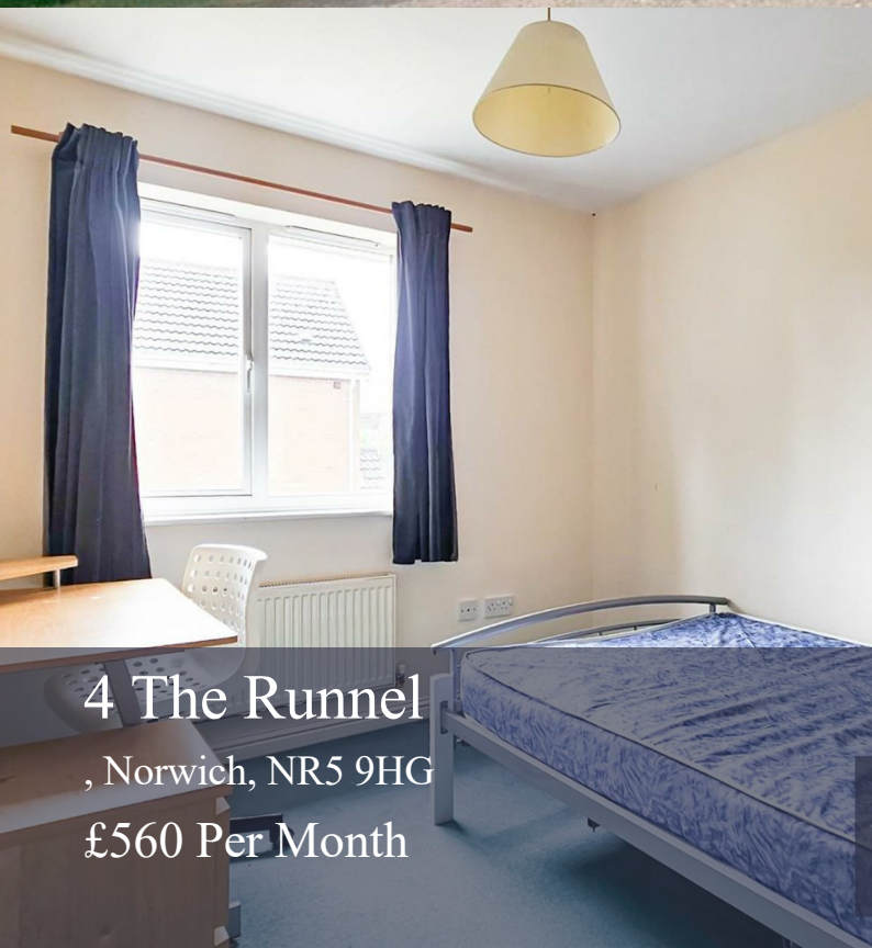
4 The Runnel , Norwich, NR5 9HG £560 Per Month