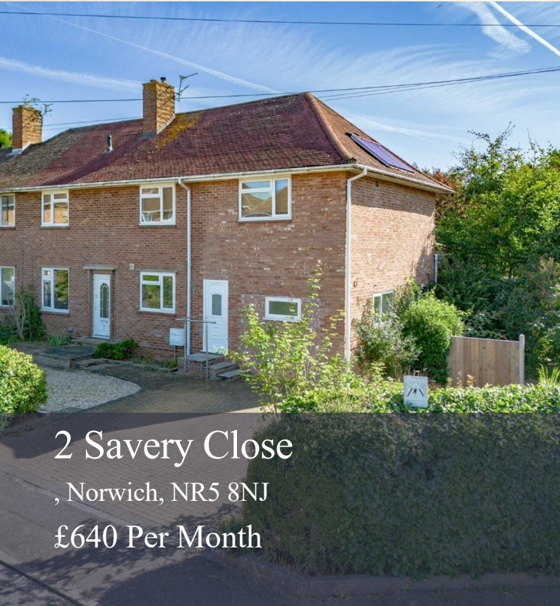
2 Savery Close Norwich, NR5 8NJ £640 Per Month