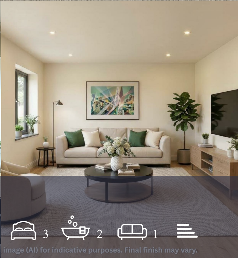
Computer generated image (AI) for indicative purposes. Final finish may vary.