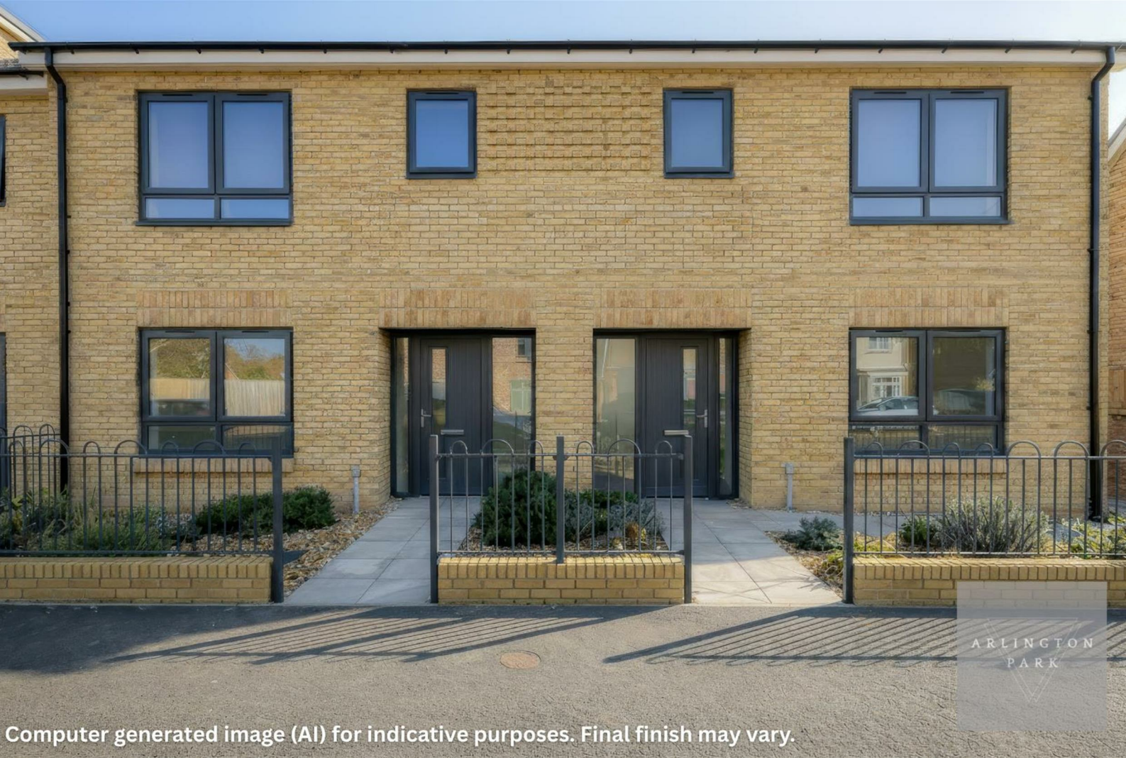
Computer generated image (AI) for indicative purposes. Final finish may vary.