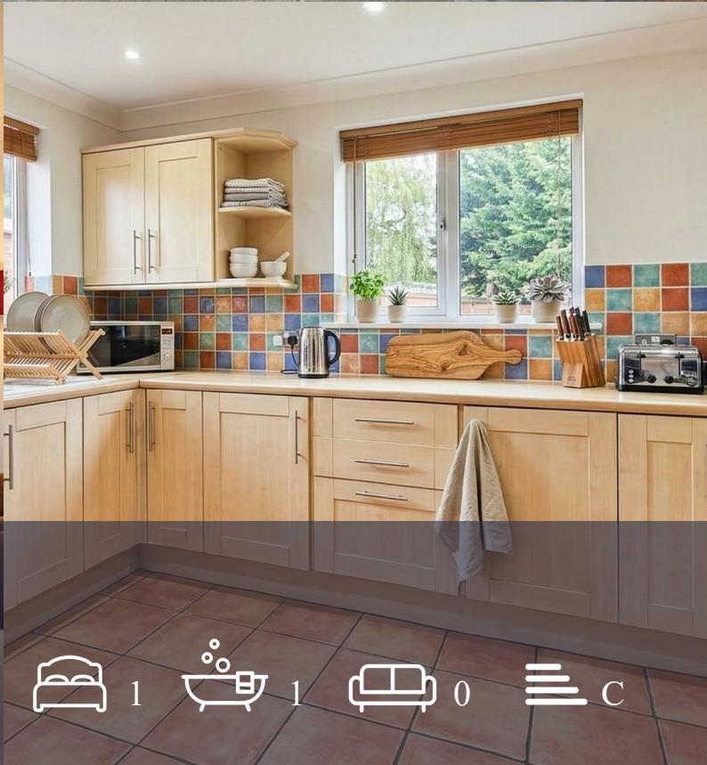
Room 5, 44 Milton Close , Norwich, NR1 3HX £540 Per Month