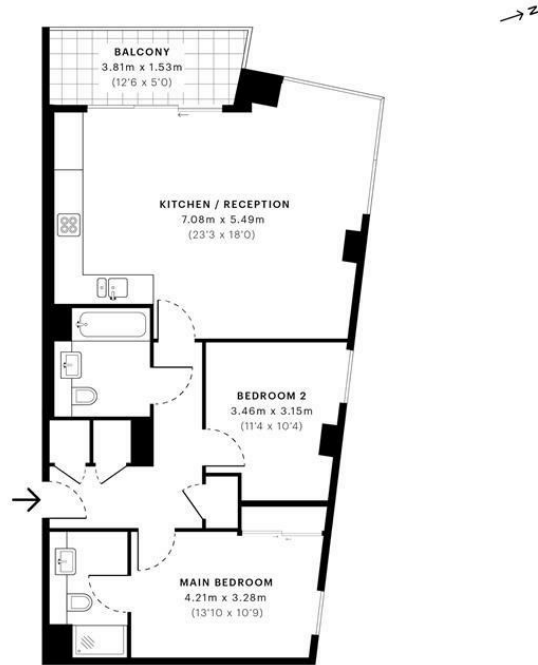
— Fifth Floor

GROSS INTERNAL AREA (GIA) The footprint of the property 77.06 sqm / 829.47 sqft