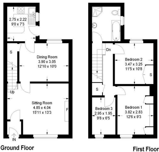
Illustration for identification purposes only, measurements are approximate, not to scale. FloorplansUsketch.com © 2013. (ID65715)

Approximate Gross Internal Area = 84 sq m / 904 sq ft