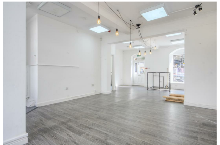
High Street Retail Unit (EPC Rating: D)