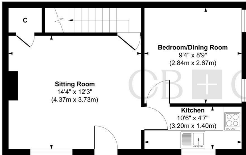
Ground Floor Approximate Floor Area 383 sq. ft (35.58 sq. m)