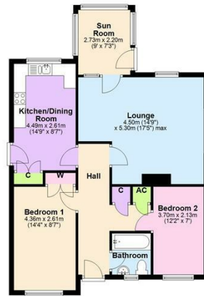
Total area: approx. 92.7 sq. metres (998.1 sq. feet)