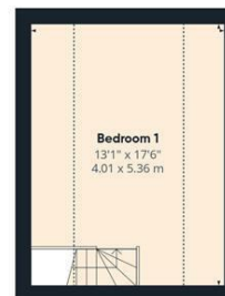
Floor 3 Building 1