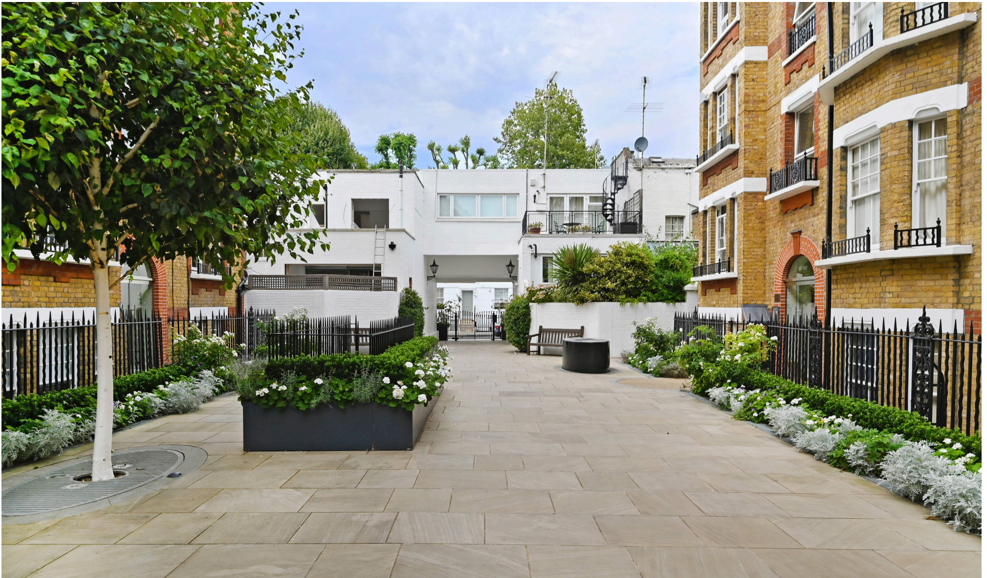
Walton Street, Chelsea, SW3