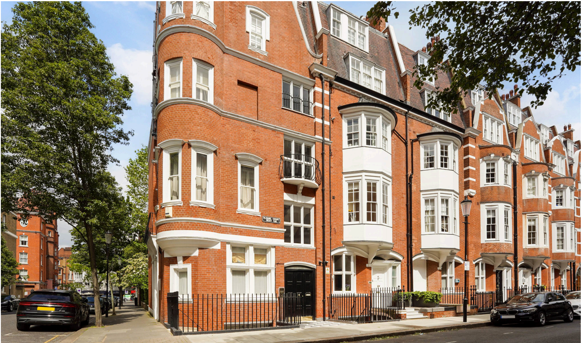
Sloane Court West, Chelsea, SW3