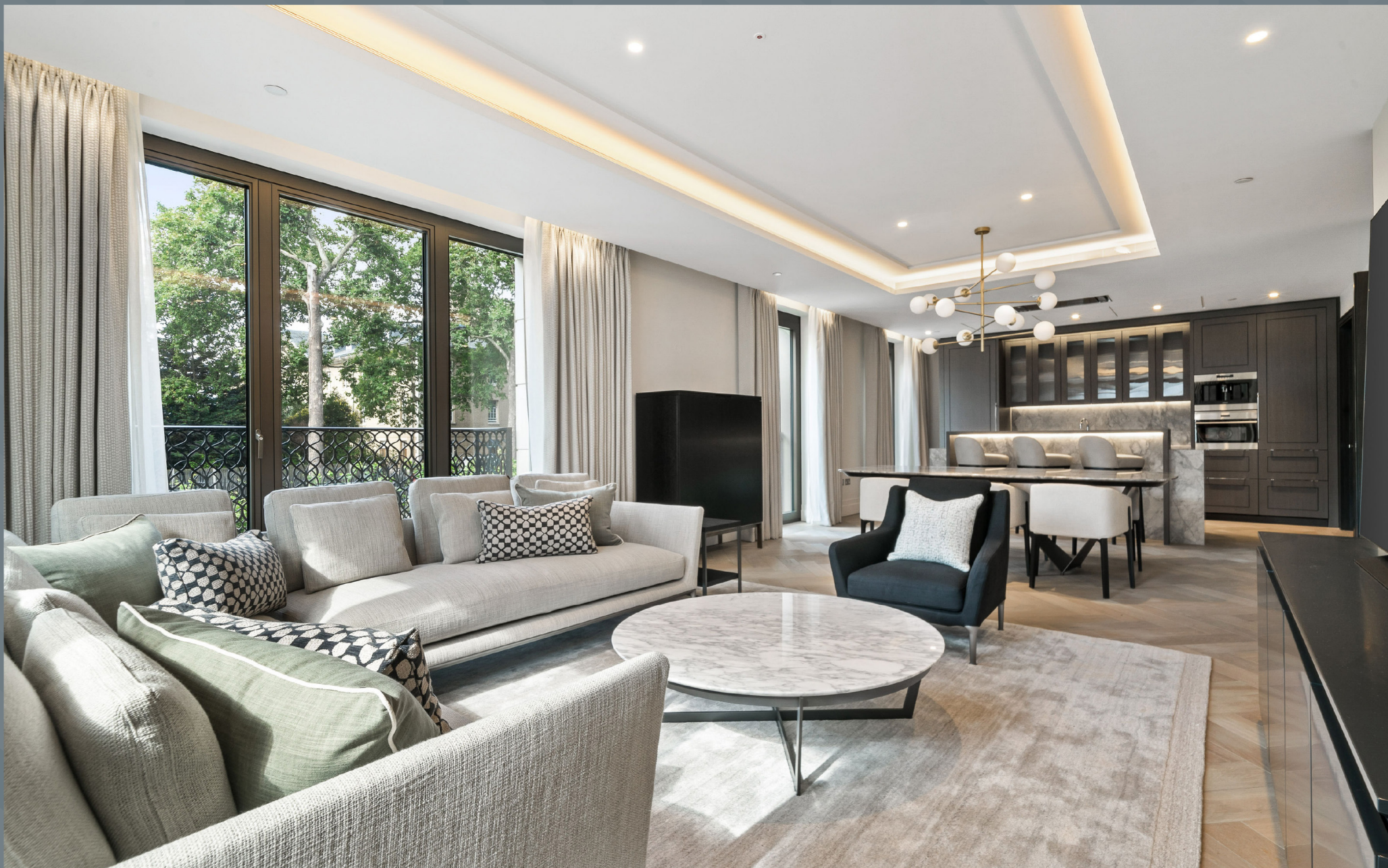
Mulberry Square CHELSEA BARRACKS SW1W