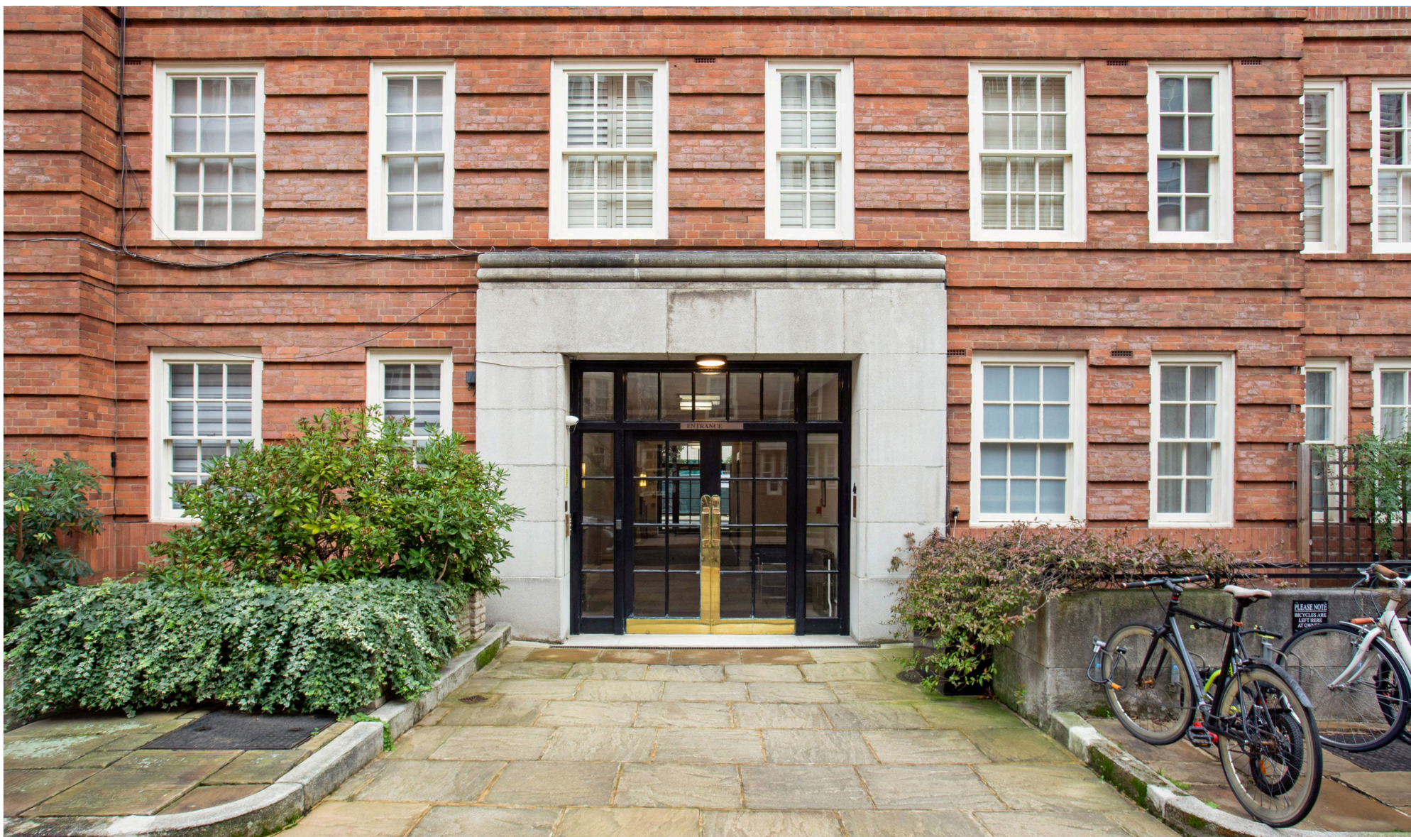
Cranmer Court, Chelsea, SW3