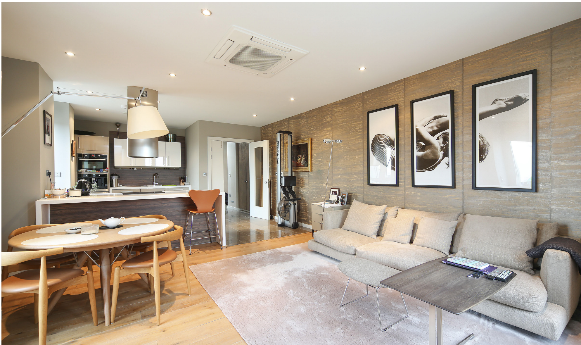
Palace Place, Westminster, SW1E