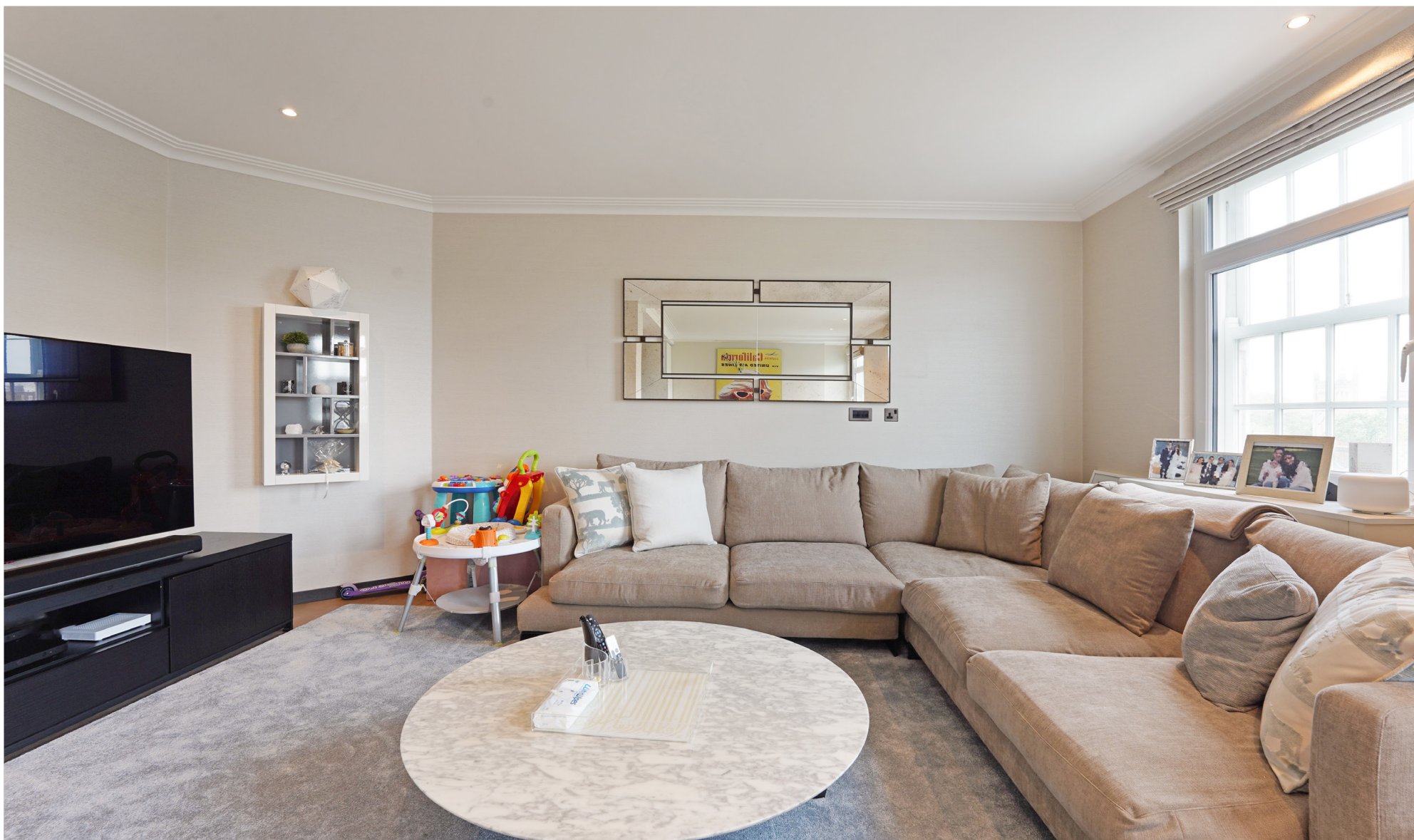
Ovington Court Knightsbridge, SW3