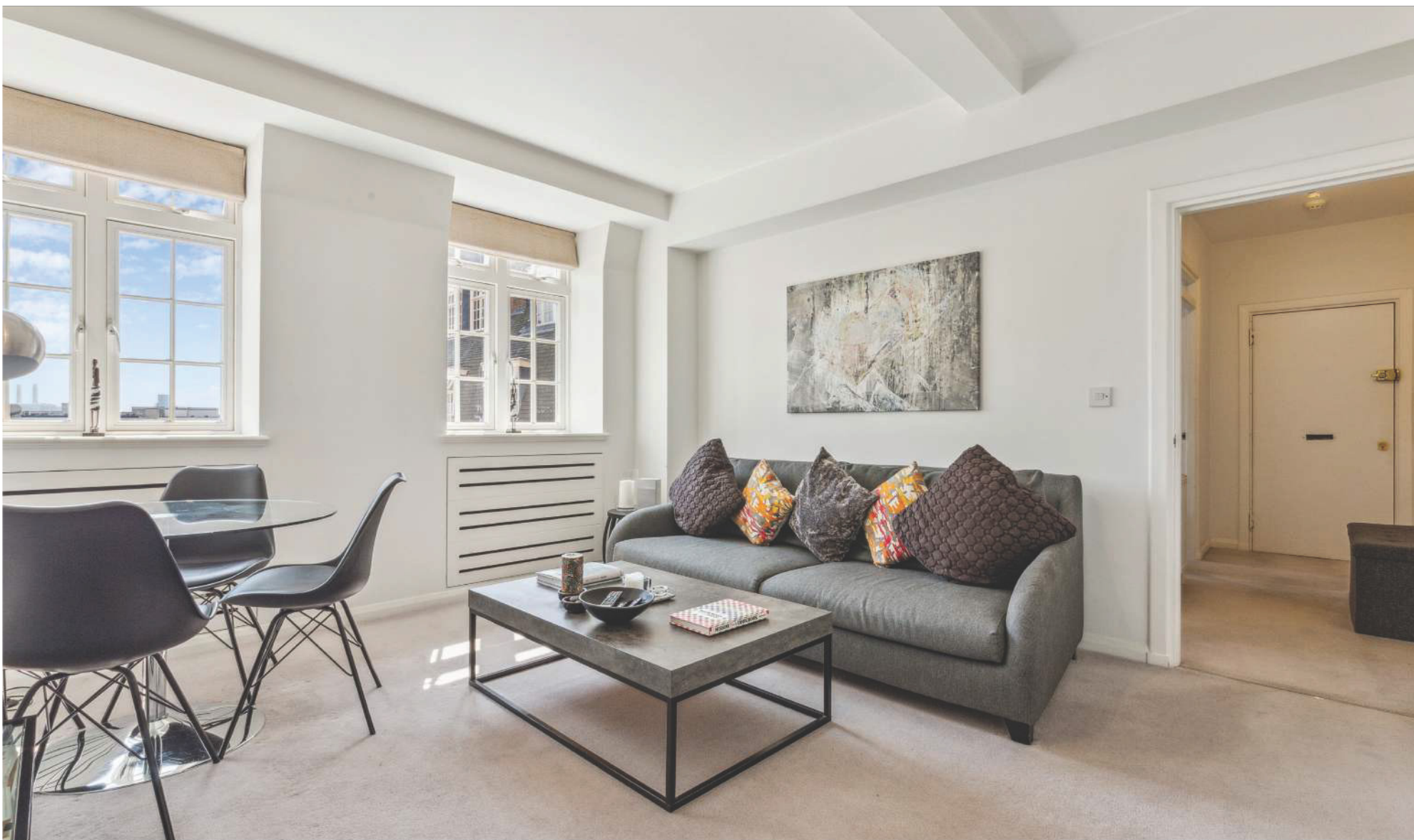
Cranmer Court Chelsea SW3