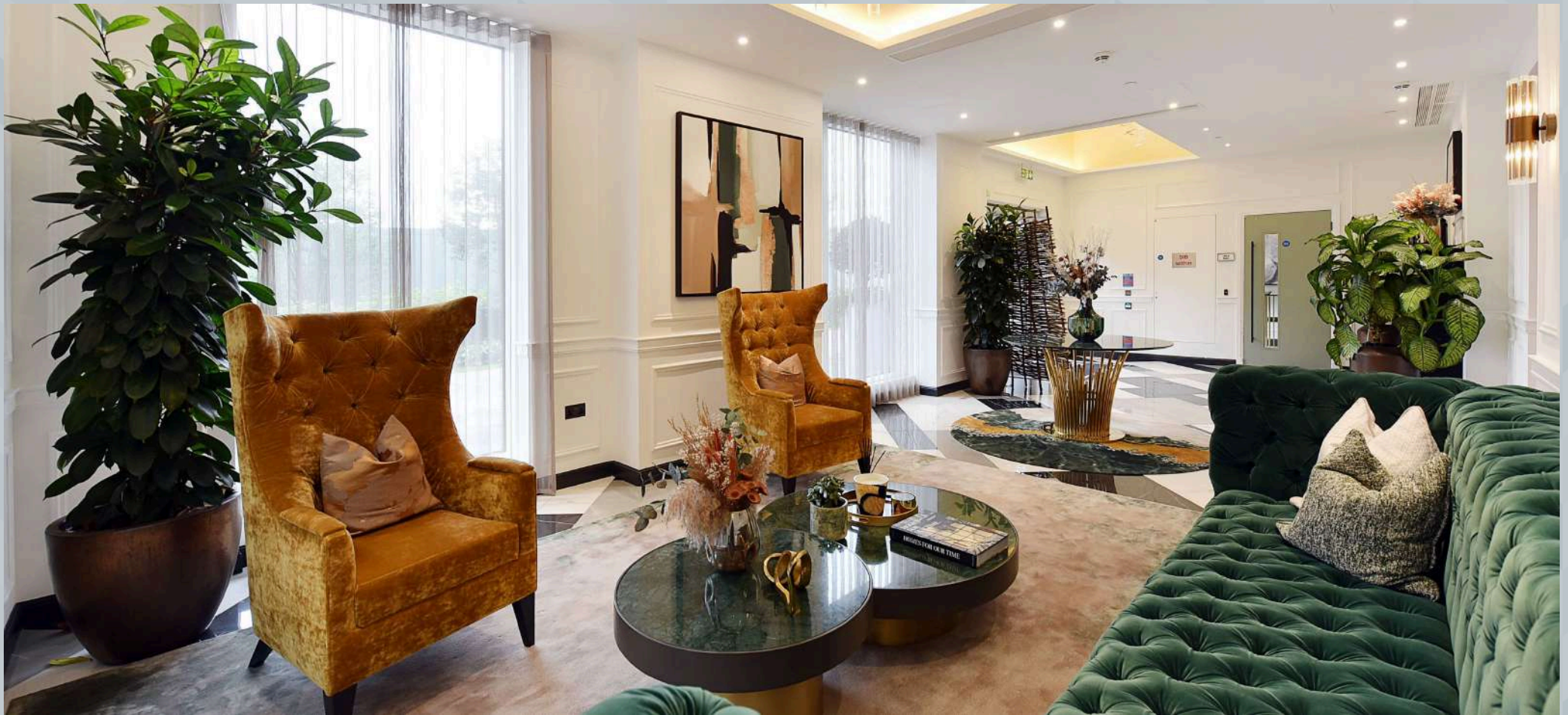
The Halcyon Club