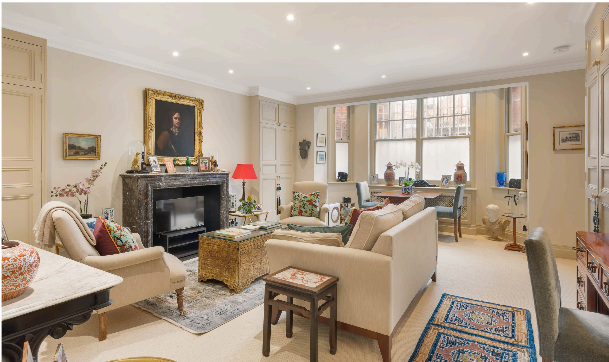
Egerton Gardens, Chelsea, SW3