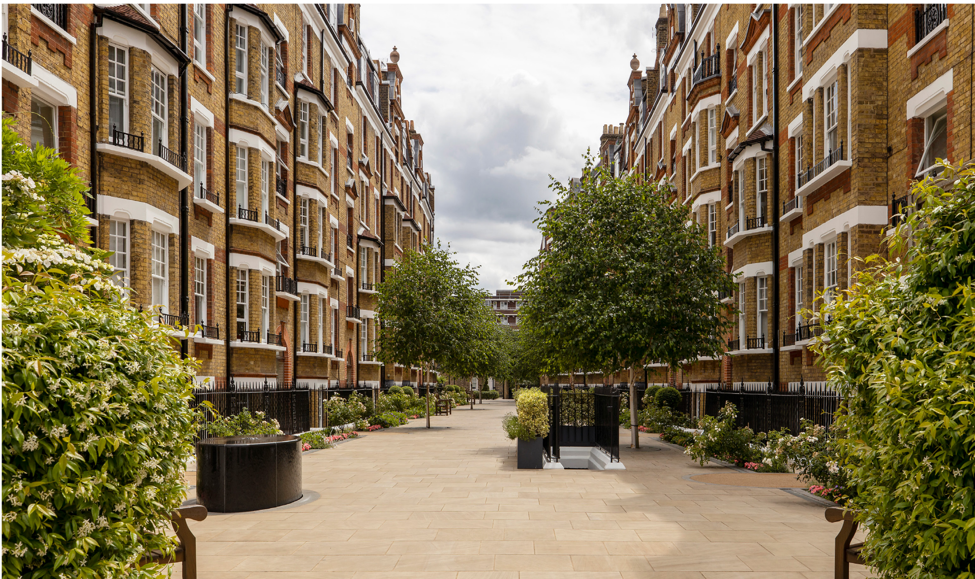
Walton Street Chelsea SW3