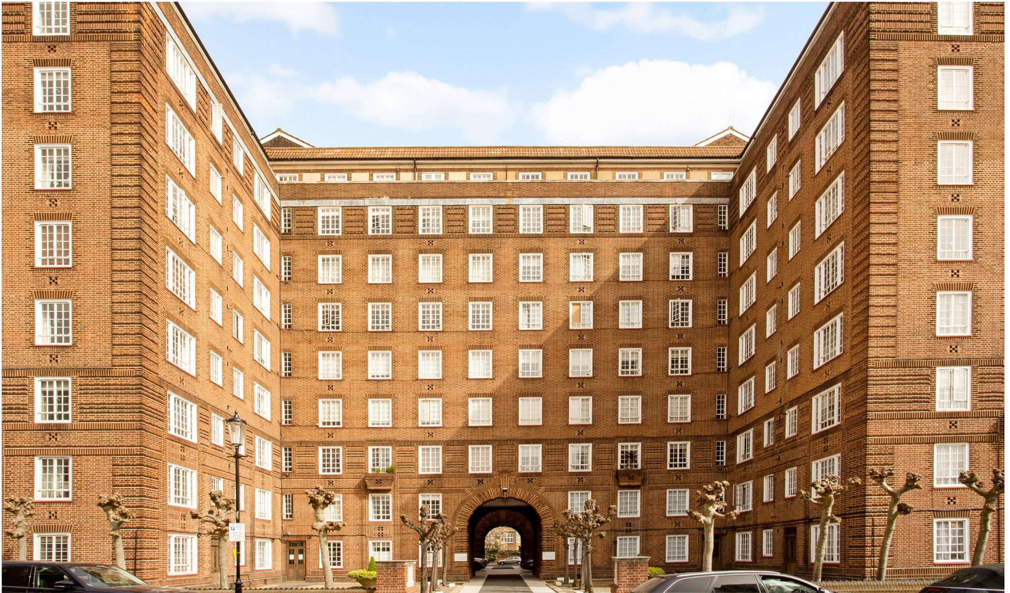
Swan Court Chelsea Manor Street, SW3