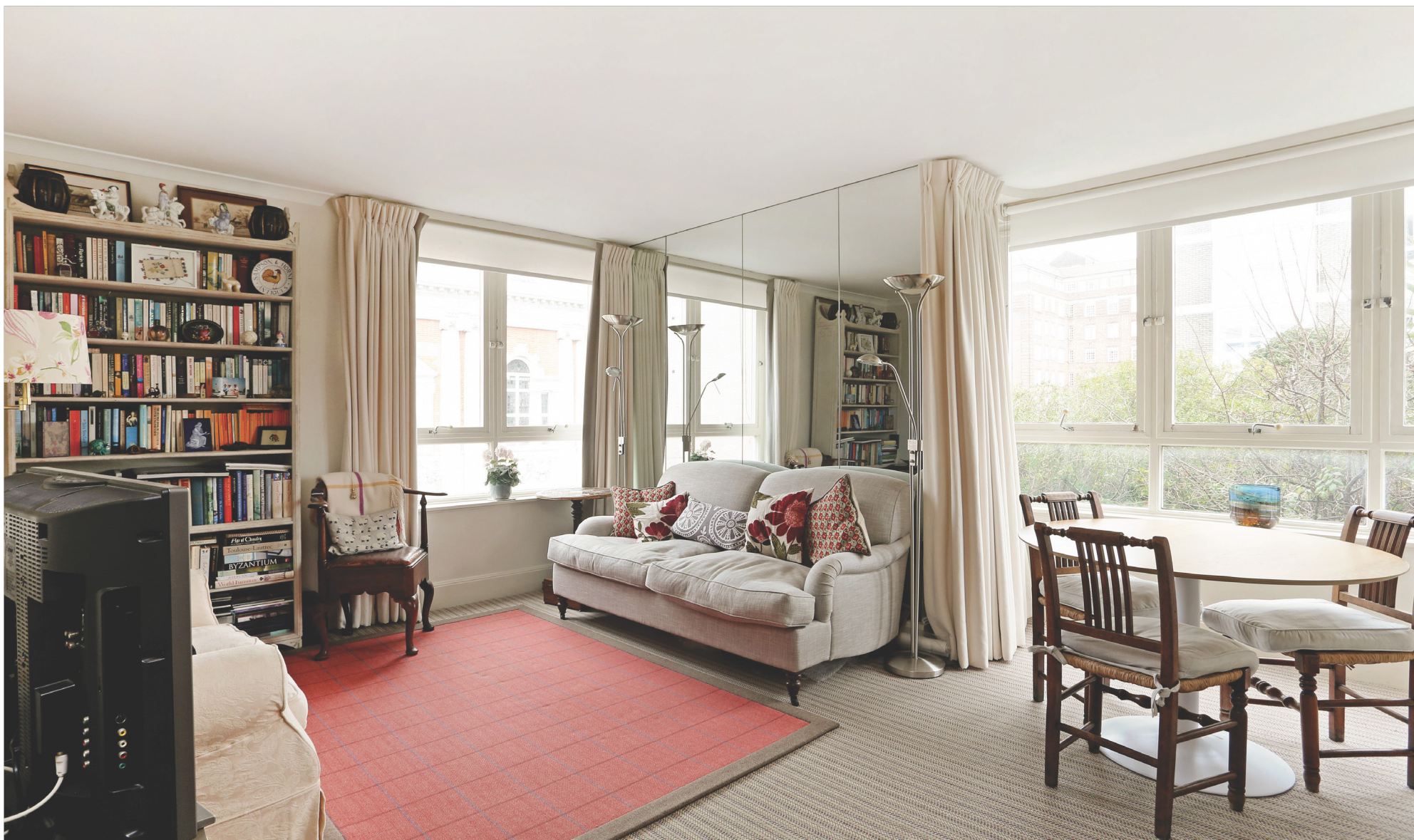
Chelsea Towers Chelsea Manor Gardens, SW3