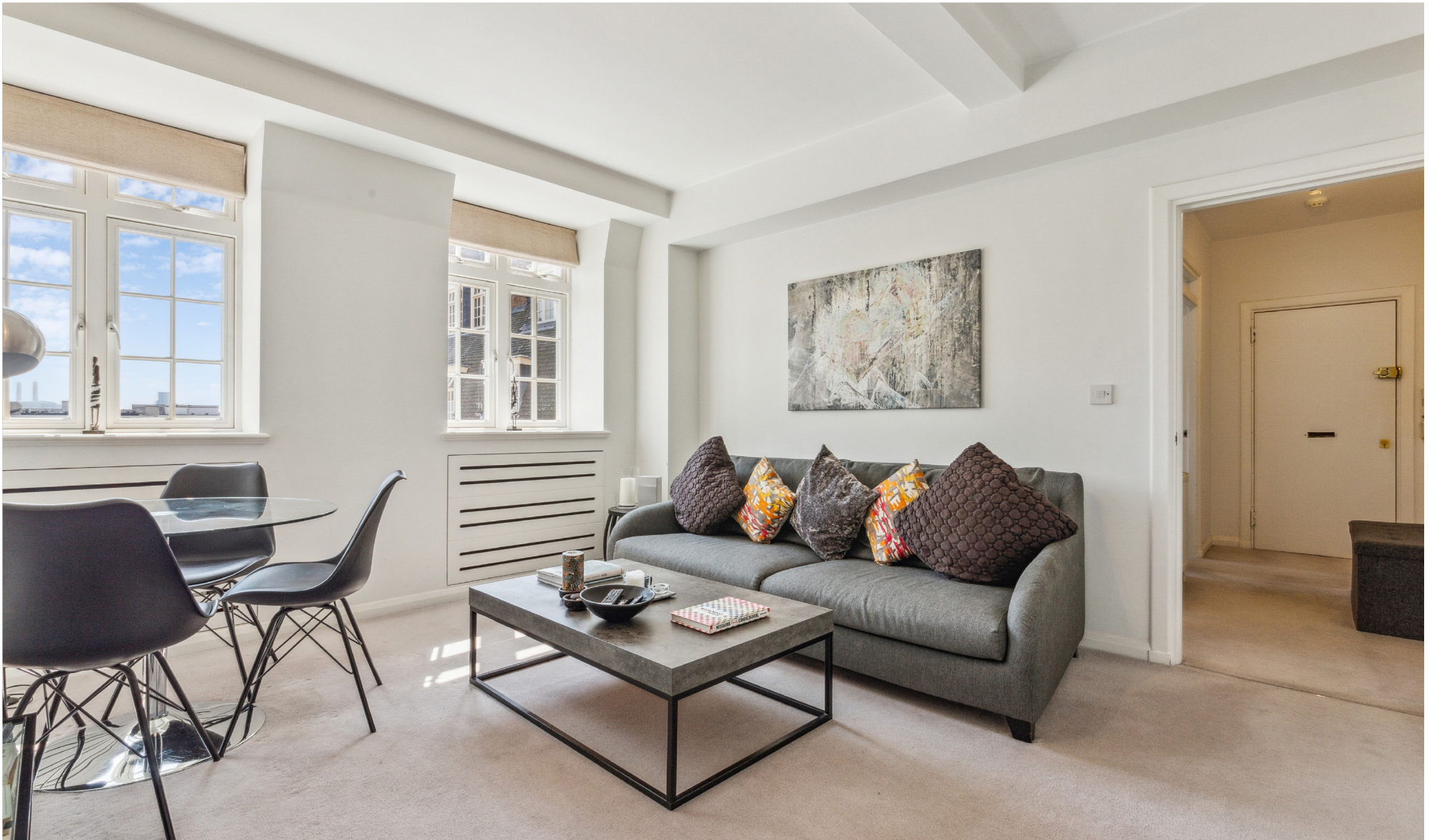
Cranmer Court Chelsea SW3