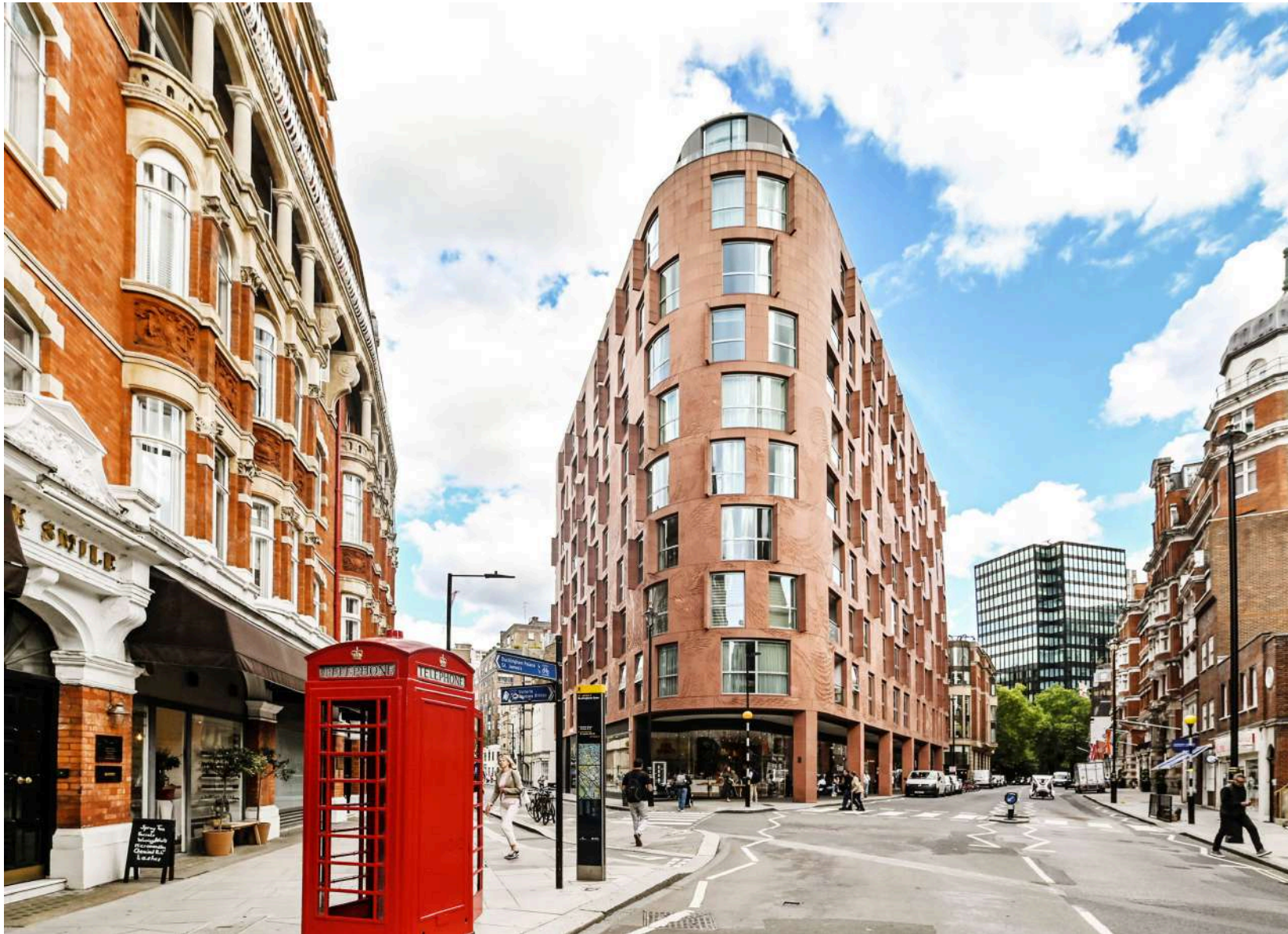
Buckingham Gate, Westminster, SW1E