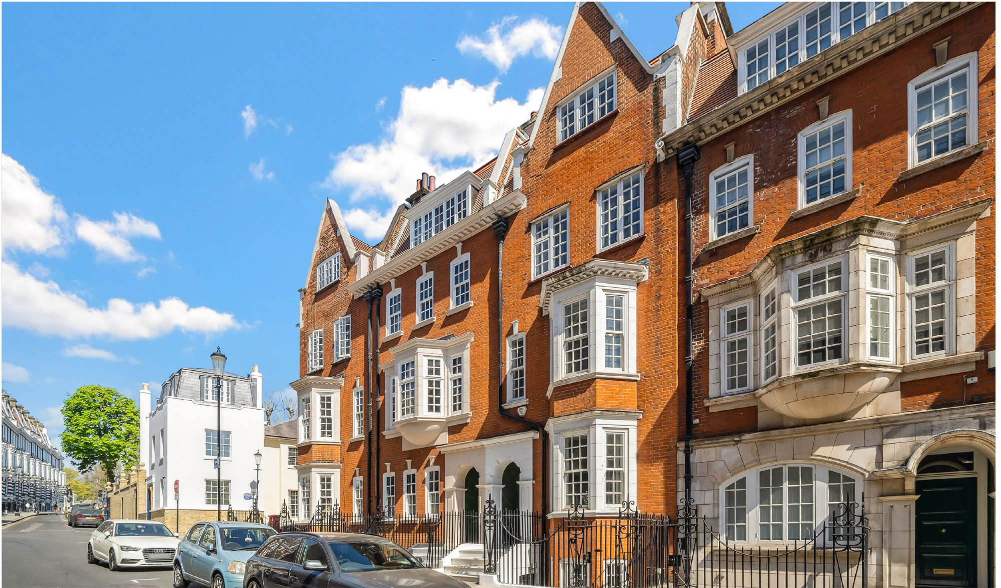
Hornton Street Kensington W8