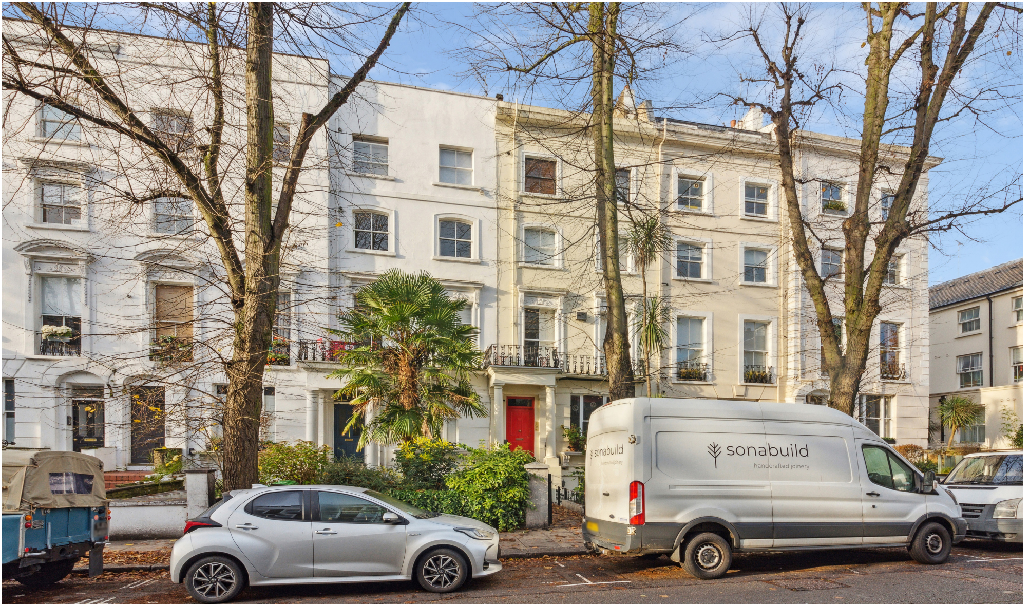
Moorhouse Road Notting Hill W2