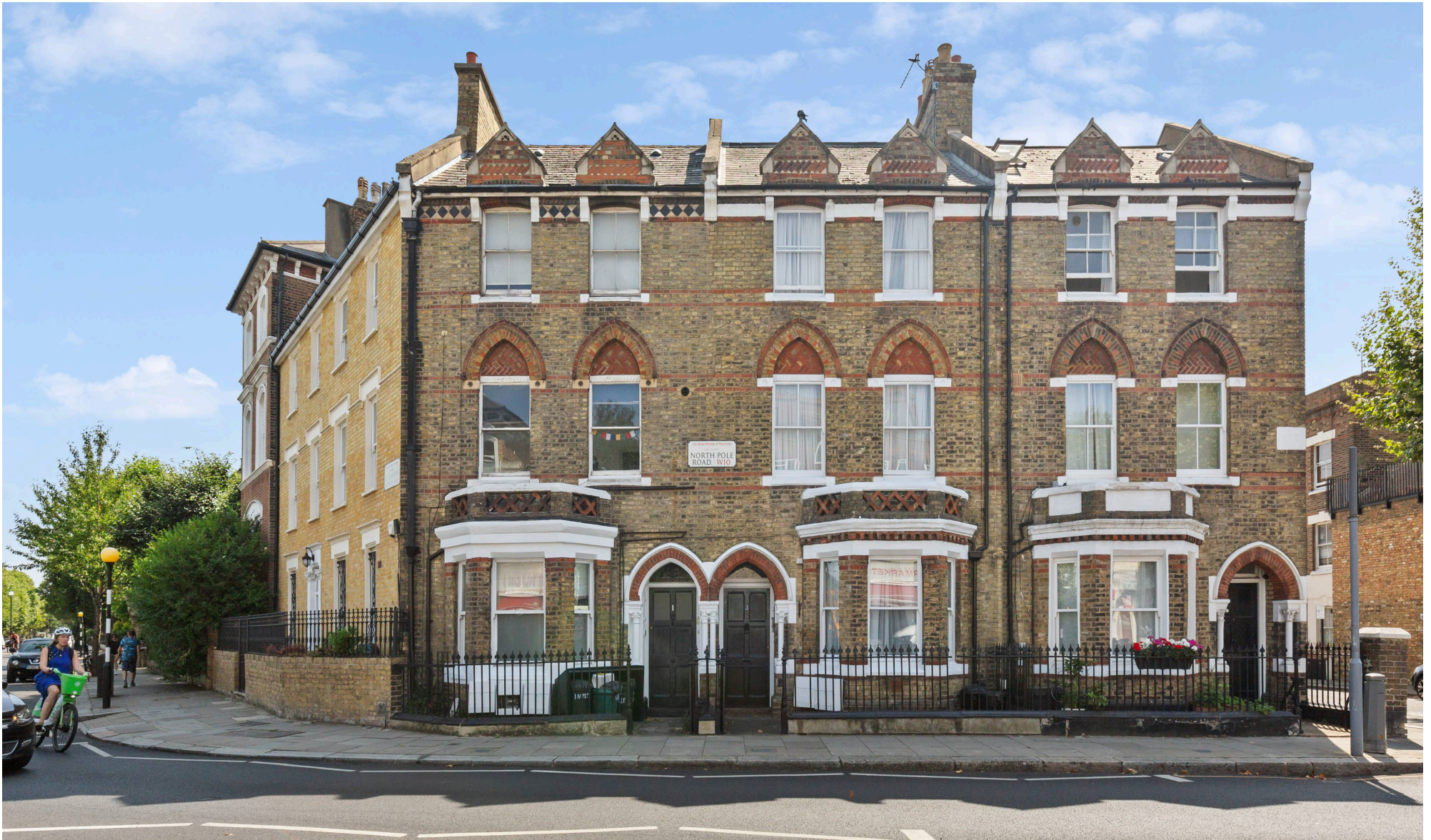
North Pole Road, Kensington, W10