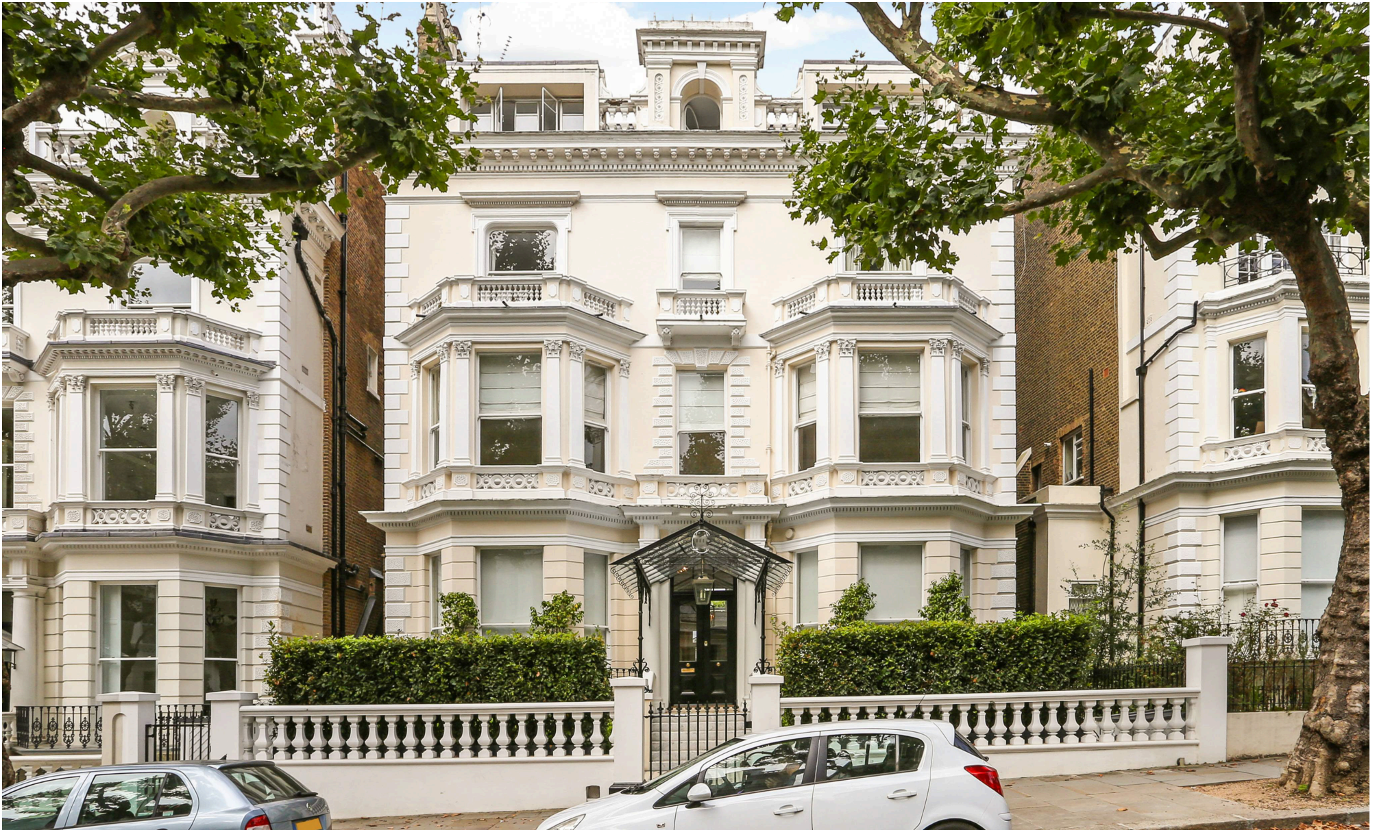
Holland Park, London, W11