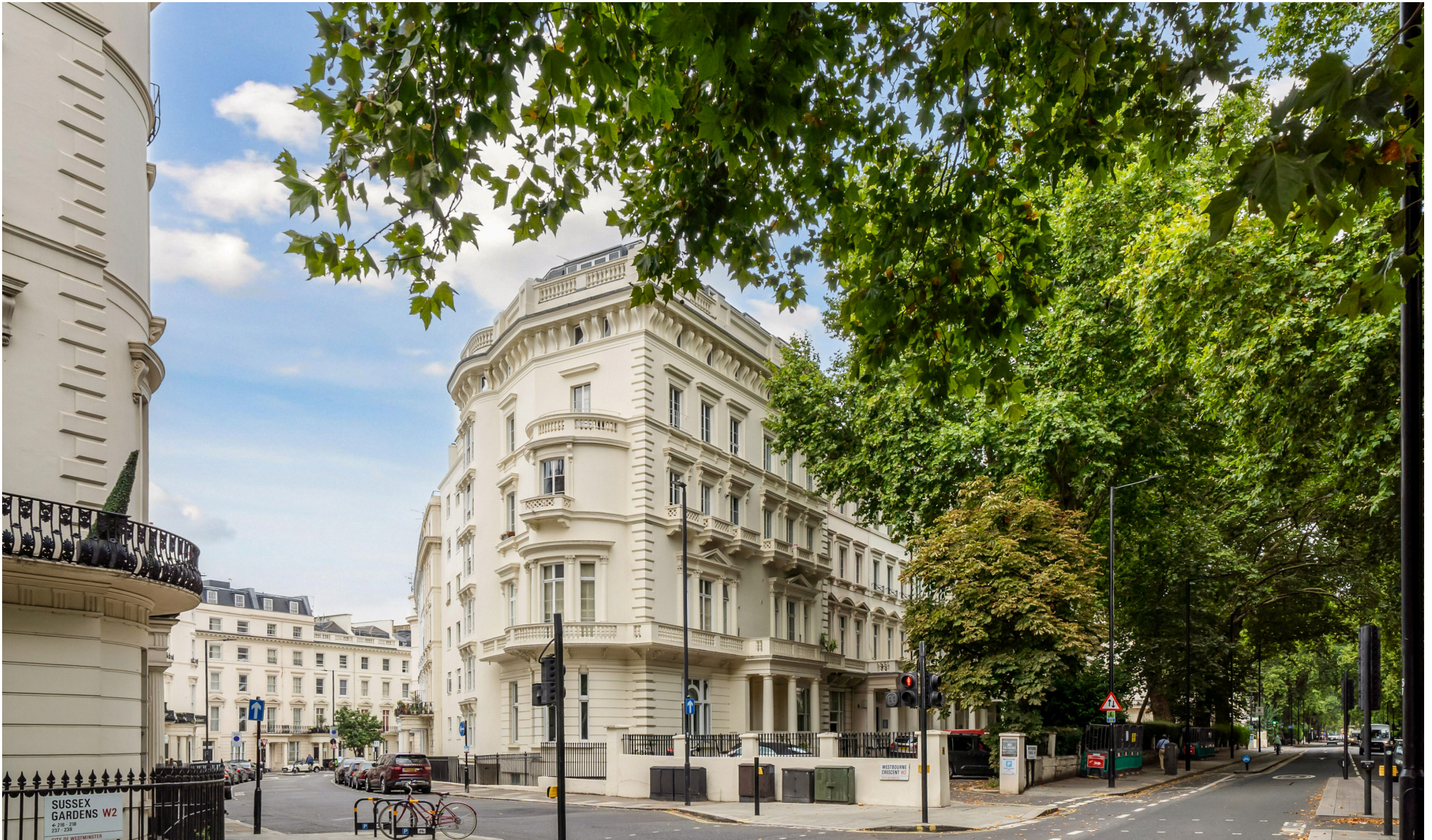
Barness Court, Bayswater, W2