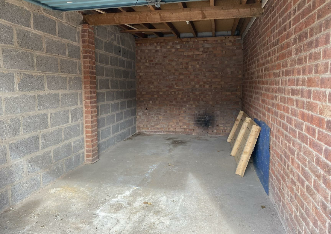
4.95m x 2.54m garage for sale located on Hardwick Crescent in Syston.