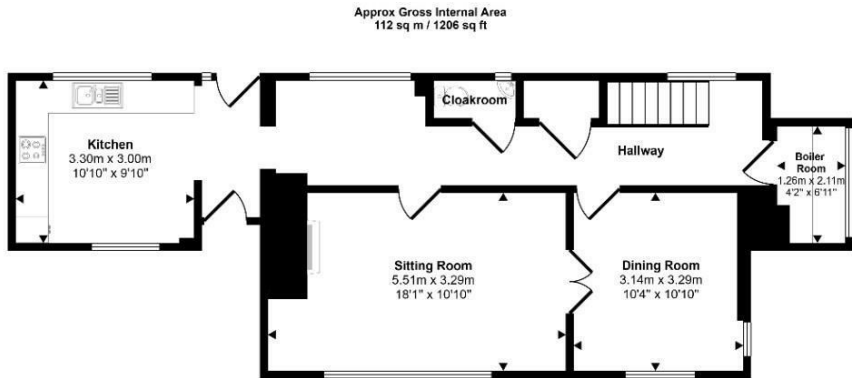
Ground Floor Approx 65 sq m / 696 sq ft

Available long term with initial 12 month tenancy.