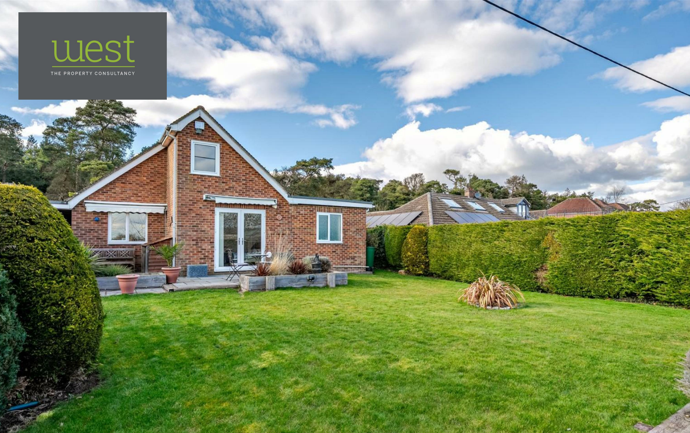
The Firs Gainfield, Faringdon, SN7 8QQ Guide Price £650,000