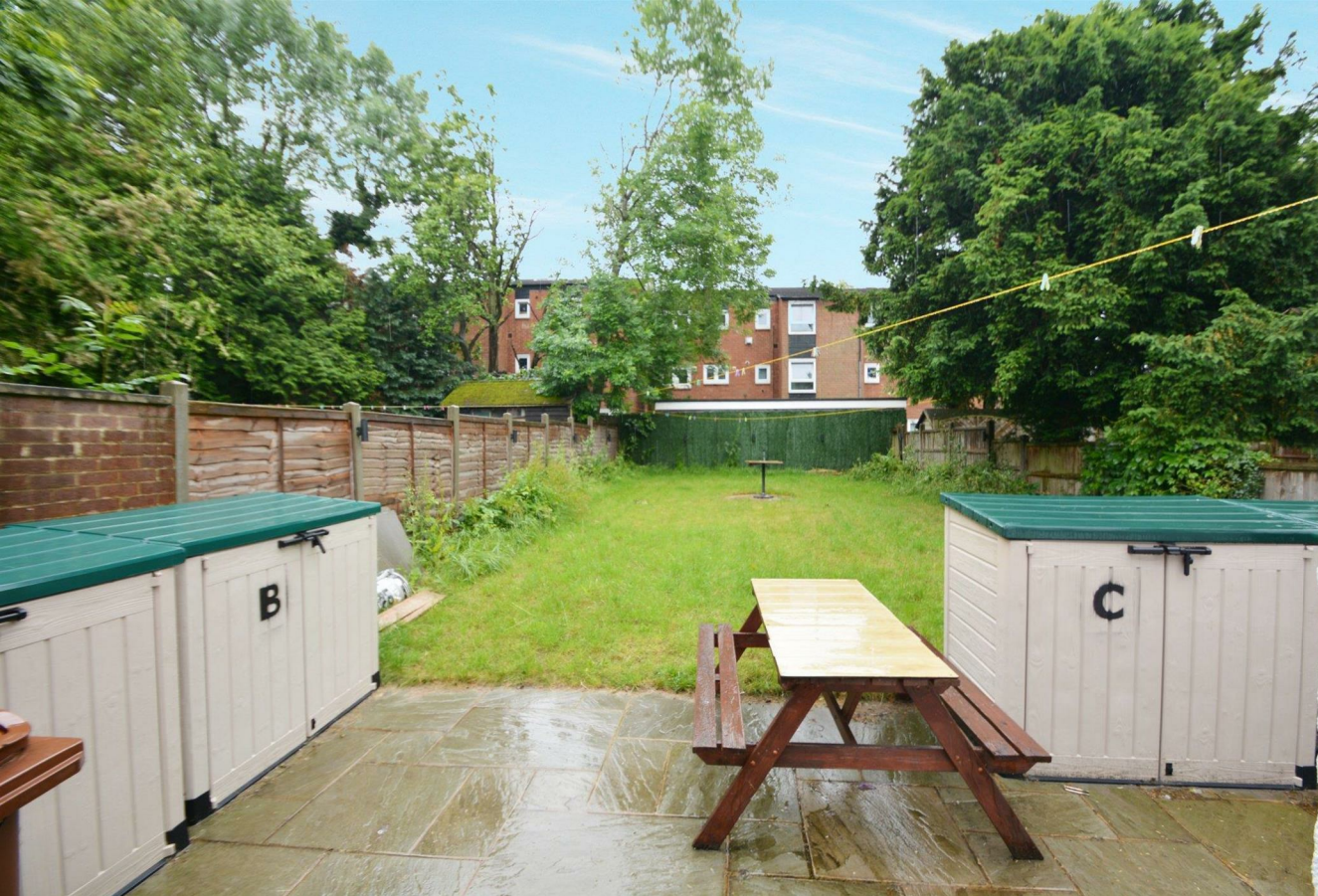
Council Tax Band - C