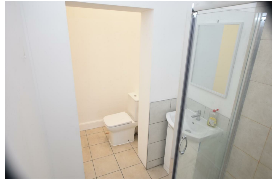
STUDIO ROOM SHOWER ROOM/WC

*INCLUDES ALL BILLS EXCLUDING COUNCIL TAX* David Conway are pleased to offer this first floor unfurnished studio flat - 15'9 x 11'10 studio room, Newly refurbished incorporating kitchenette with oven/induction Hob, separate shower room/wc, upvc double glazed. Available Now!! Council tax band A (£1,441.87) Rent £1100.00 per calendar month.