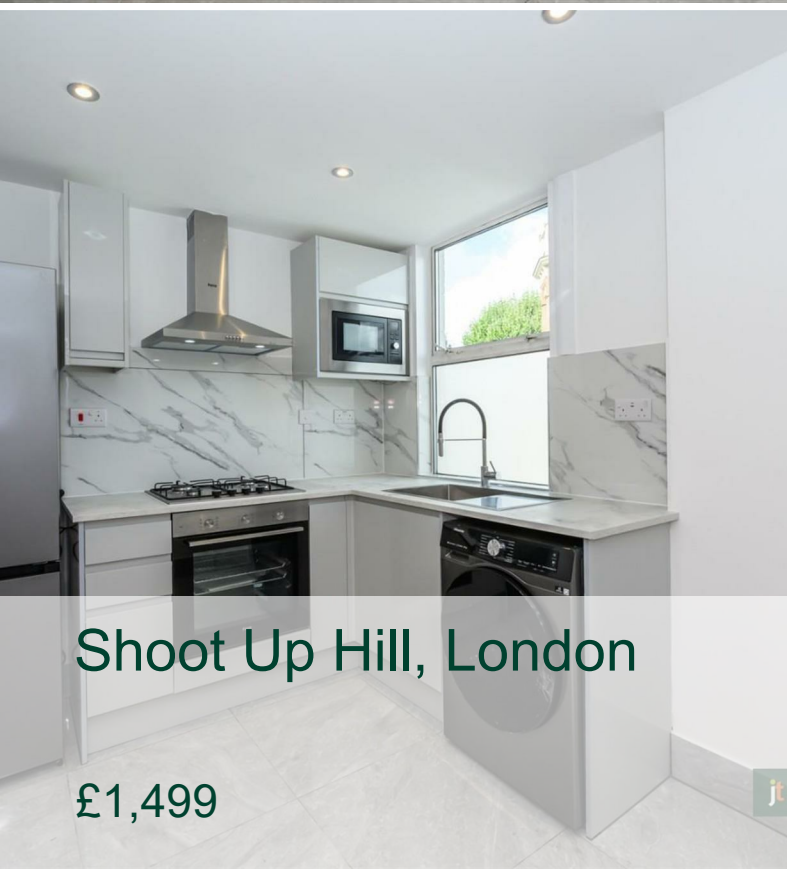
Shoot Up Hill, London