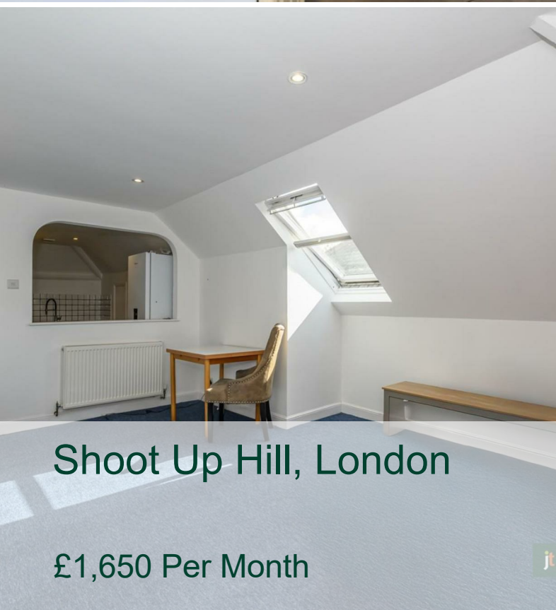
Shoot Up Hill, London