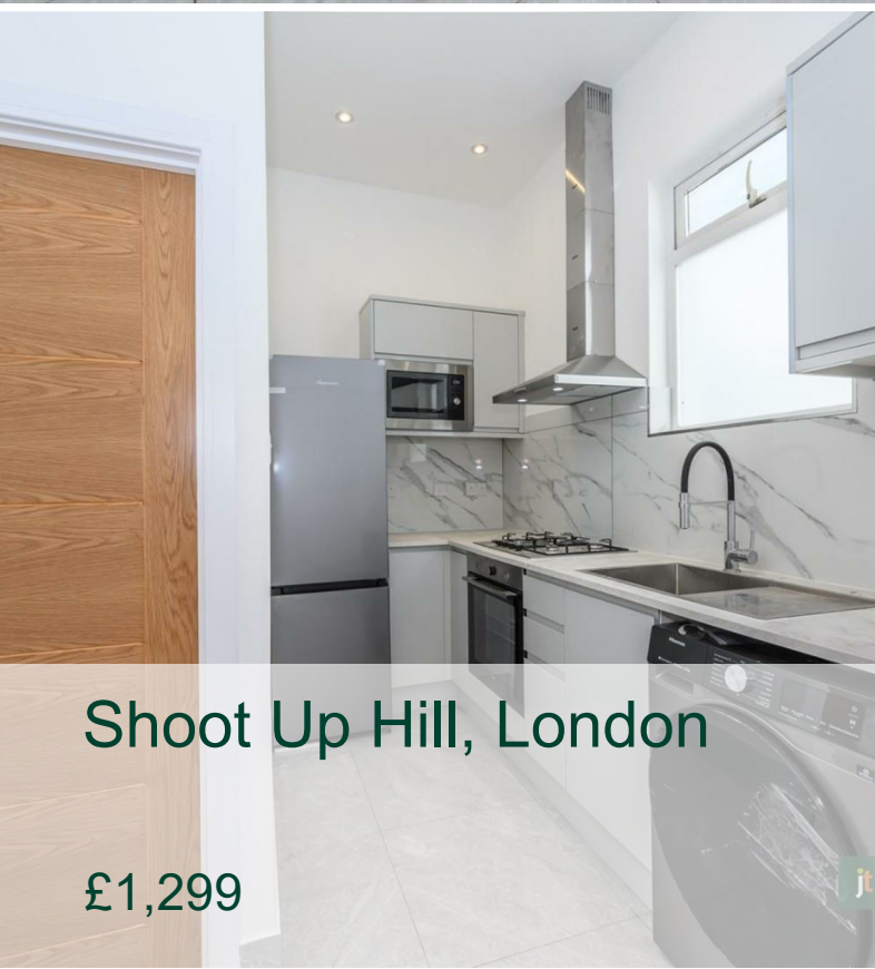
Shoot Up Hill, London