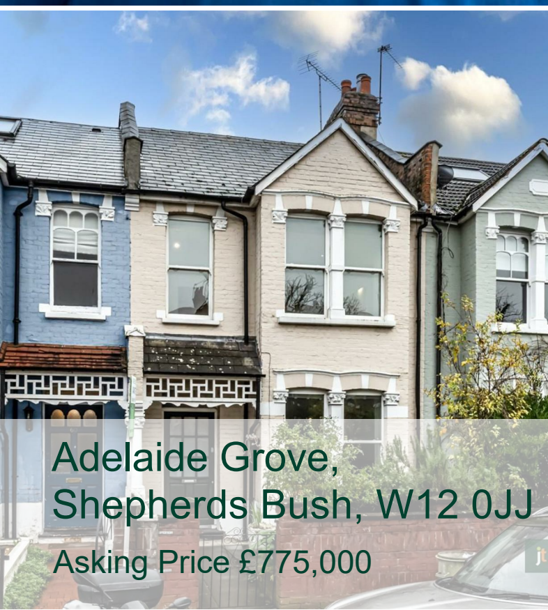
Adelaide Grove, Shepherds Bush, W12 0JJ Asking Price £775,000