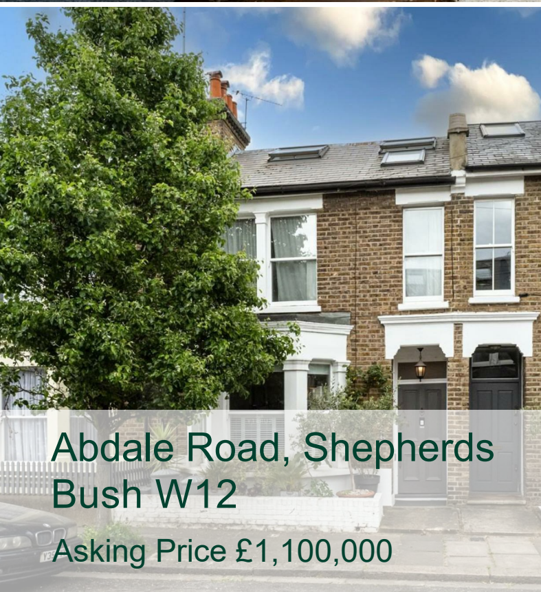
Abdale Road, Shepherds Bush W12