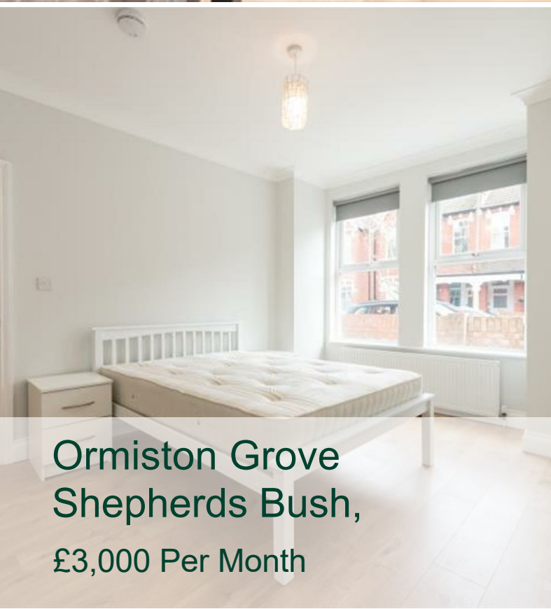
Ormiston Grove Shepherds Bush, £3,000 Per Month